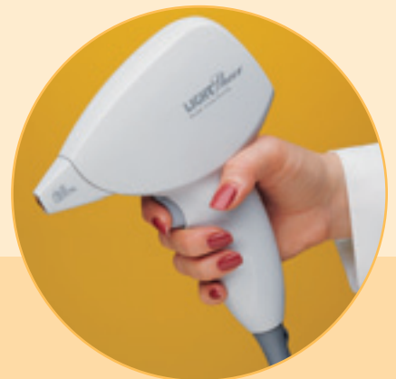
ChillTip contact cooling provides superior epidermal protection